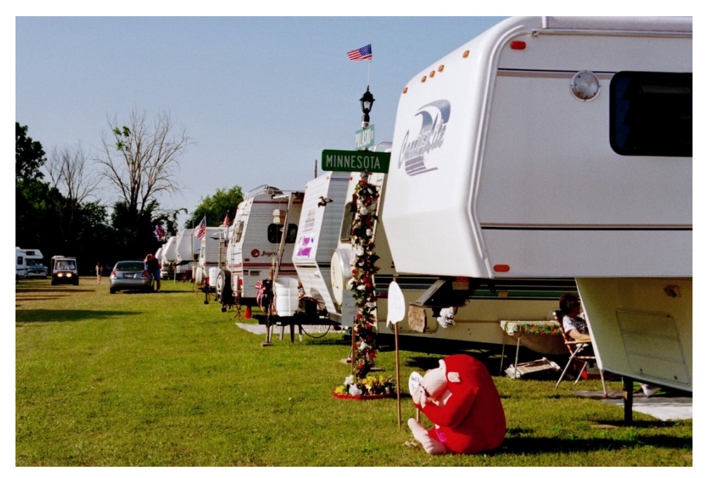
Figure 2. A motor home "village" at Pulaski Polka Days, 2004.