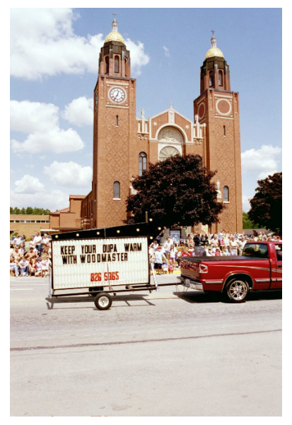
Figure 10. Polish American linguistic capital on display in the Pulaski Polka Parade, 2004.

This image is most stunning for its juxtaposition of ethnic vulgarity in front of the parish church of Pulaski. But this juxtaposition also reveals one of the driving forces of my research, that is, the reclaiming of what Mary Erdmans calls American-grown Polishness. Her sociological study, The Grasinski Girls (2004) , notes that her subjects "posit Poland as the source of real Polishness, and in doing so they minimize their American-grown Polishness" (63). They question their own Polish American ethnicity in the language of realness, noting that they are not "that Polish." One way to challenge the persistent discourse of inauthenticity in Polonian experience is to recognize variety within Polish American identity formation, which while varying greatly, is equally "authentic."