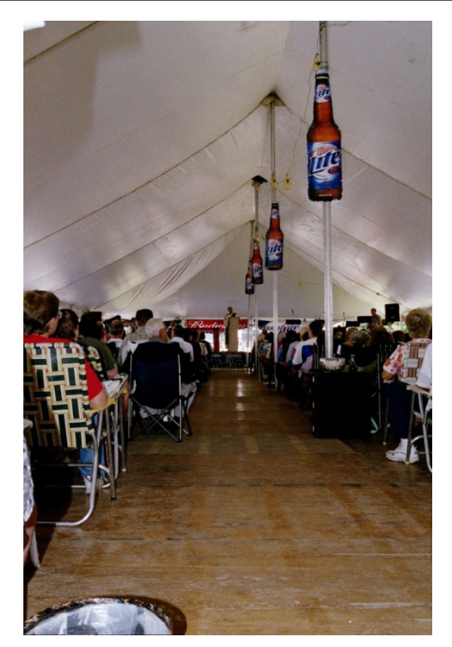
Figure 4. The Sacred and Profane merge at the Polka Mass, Pulaski Polka Days, 2004.