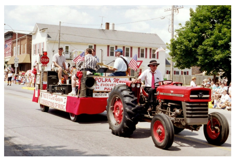
Figure 9. A postmodern pastiche of ethnic symbolism in Pulaski's Polka Parade, 2004.

The Pulaski polka parade is a virtual feast of hybrid ethnic symbolism. [See Figure 9] In a stunning moment of visual pastiche, an antiquated American tractor was driven by a farmer in a Górale [Polish mountaineer] hat, pulling a wagon that carried polka musicians. The wagon was decorated by American flags and a hand-written sign claiming "polka music evolves in Pulaski."