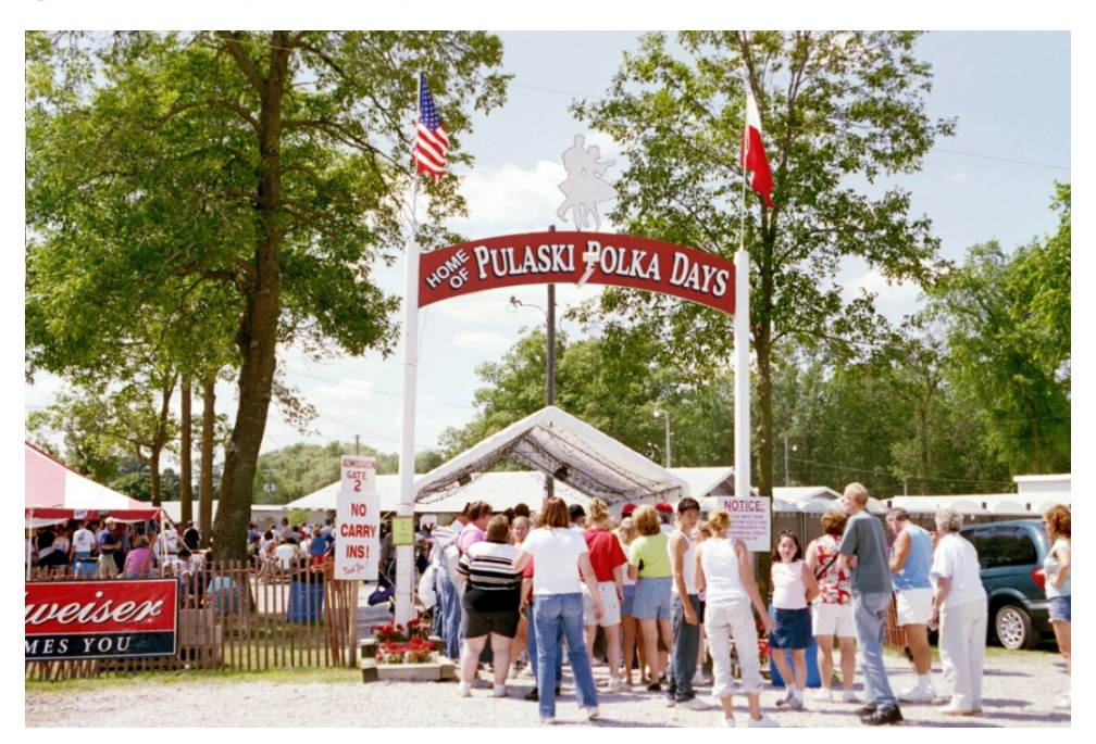
Figure 1. Entering the "neighborhood" at Pulaski Polka Days, 2004.

Recent scholarship on Polish American polka has argued that contrary to popular stereotype, polka is innovative hybrid alternative music and, furthermore, that preserving polka's history is an important, but often overlooked, part of preserving American multicultural history (Gunkel 2006, 5 - 8). This project continues that research by providing this spatially-framed study of the phenomenon of the seasonal polka festival. Over a period of five years, I visited polka festivals in North America as a participant observer, documenting the social and cultural landscape of these gatherings of polka festivals—understood as a diasporic ethnoscape--exploring the construction of ethnic space in the twenty-first century.