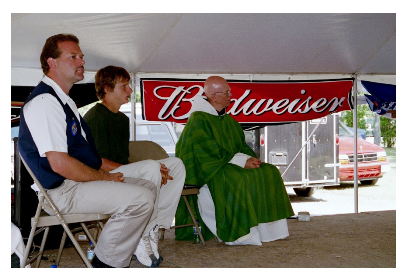
Figure 5. The Priest and Acolytes at Polka Mass, Pulaski Polka Days, 2004.

This shamelessness about Catholic Polish identity is a signal of great confidence in ethnic identity formation, if we recall that for more than a century "immigrant Catholicism or "ghetto Catholicism" was seen as "an obscurantist form of cult worship