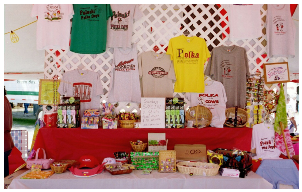
Figure 6. Souvenir Tent at Pulaski Polka Days, 2004.

This resilience is also seen in the polka community's ability to sustain an independent polka economy, a community-based business alternative to the mainstream of corporate music production (Gunkel 2004, 414). [See Figure 6] In addition to the festivals and conventions, this economy includes polka recording studios, production and distribution, record and CD labels, polka record stores, polka Radio shows polka cruises and travel, polka internet sites, polka associations such as the IPA (International Polka Association) and UPA (United Polka Association), and polka publications. [See Figure7]