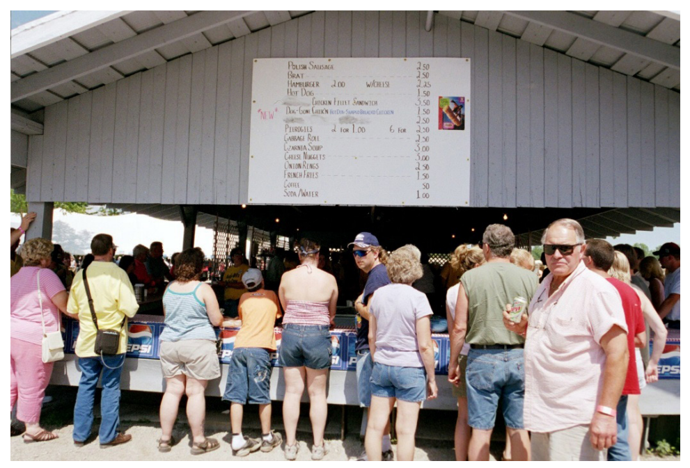
Figure 8. Food Concessions at Pulaski Polka Days, 2004.

Duck's Blood Soup], a dish virtually unknown in contemporary Poland (even absent from Polish dictionaries) but a classic for late nineteenth century émigrés from the Prussian partition of Poland. Five generations later, Polishness means Czarnina .