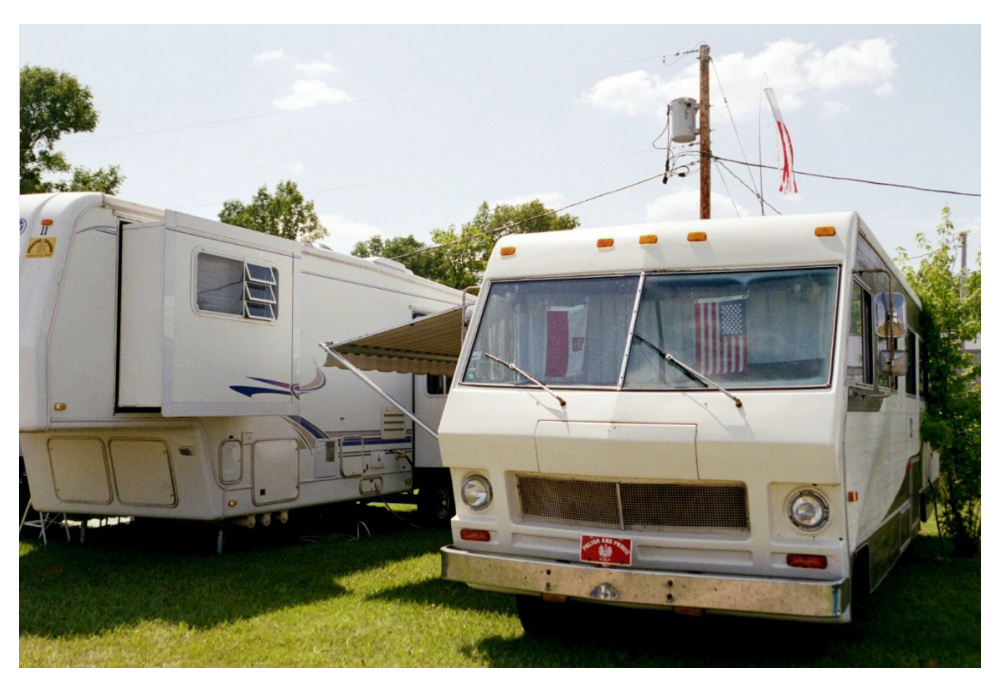
Figure 11. Mobile Home in the Ethnic "Neighborhood" displaying Polish American symbols.

In his critical work on cultural dimensions of globalization, Arjun Appadurai (1996) distinguishes between culture and the cultural. While culture is associated with a static conception of a people associated with specific traits, the cultural refers to situated differences, contrasts, and comparisons "that either express, or set the groundwork for, the mobilization of group identities" (13). Appadurai's distinction expresses the fluidity of identity associated with diasporic movements. Describing complex repertoires of images, narratives, and ethnoscapes, he notes that ethnic images are diasporic. Appadurai recognizes the synergistic and serendipitous nature of the flow of representations. I would argue that this is the nature of the symbolic landscape from which Polish American polka people draw to fashion their group identity. In this landscape, symbols of farm prosperity, twentieth century nationalisms, hybrid music, Polish folk culture, and American ethnic urbanism all emerge as a field from which polka people craft their sense of identity and belonging. This sense of Polish American identity is formed in the space of a mobile community of polka music fans who recreate a movable Polish American "neighborhood" on the festival circuit.