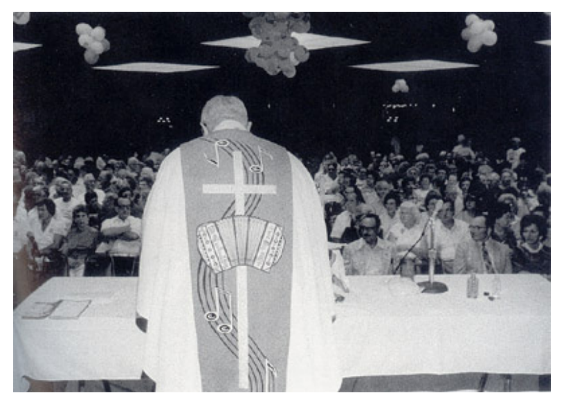
Figure 3. Priestly vestments at the International Polka Association's Polka Mass, 1983.

The carefully embroidered priestly vestments [See Figure 3] worn by the celebrant at polka Mass visually reflect this postmodern pastiche of ethnic identity. One vestment photographed by Dick Blau is beautifully adorned with The Black Madonna of Czestochowa, the most revered icon of Polish religious life. The Blessed Mother is depicted alongside a crucifix,--the instrument of salvation—musical notes, and an accordion—the instrument of ethnic dancehalls and taverns; tracing, in effect, that path from Polish Catholicism to polka-based Polish American ethnicity.